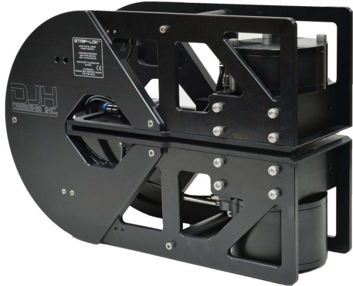
Long-Reach Heavy Gauge STRIP-LOK™ Joiner

Apart from requiring an external compressed air source the STRIP-LOK™ Joiner is fully self contained. The STRIP-LOK™ Joiner is activated as soon as the trigger is pressed and an automatic cycle of punching and flattening the two layers of metal strip will then commence. The joining cycle will immediately stop as soon as the trigger is released.